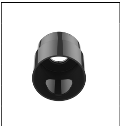
M9103501.001 Cylindrical screen (Snoot)