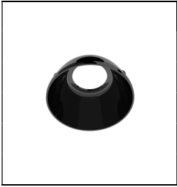
M9102101.002 Reflector Specular black