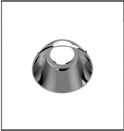
M9102101.001 Reflector Specular silver